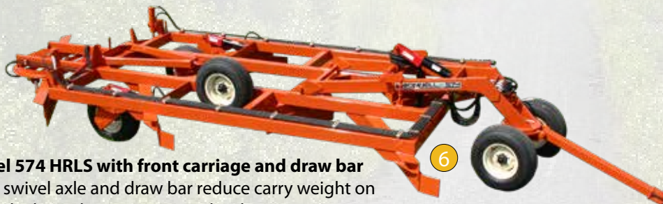
Model 574 HRLS with front carriage and draw bar Front swivel axle and draw bar reduce carry weight on pull vehicle, and promotes easy hook up